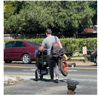
Photo: Garage sale "Super Dad", carrying handsaw, lawn blower, and pushing daughter in stroller!